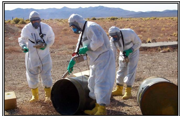
Responders measure real radiation and contamination levels at the scene of a simulated terrorist attack

The NNSS is a massive outdoor laboratory, national experimental center, and training facility located 65 miles northwest of Las Vegas, Nevada. Originally established for testing nuclear weapons, from 1951 to 1992, the NNSS was the location of 1,021 nuclear detonations and numerous radiological dispersal tests. Since the 1950s, the NNSS has been conducting training and exercises using radioactive materials and contaminated environments. Today, the 1,360 square miles of secluded and secure land at the NNSS provide a safe environment for training in realistic WMD scenarios.